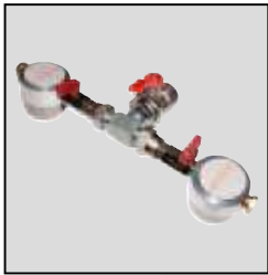
Straight Tee AC.TFK.ST