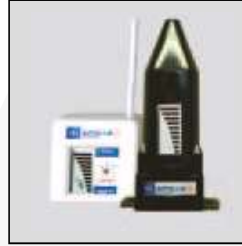
Sonic Visual GA.AP.VI