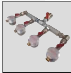
Parallel Tee 4 Gang AC.TFK.PT.4