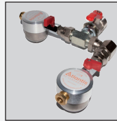
90° Tee AC.TFK.90T