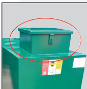
Locking Lid EXT.LID