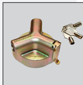
Spin Secure Tank Lock TL.020