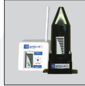
Sonic Visual GA.AR.VI