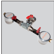
Straight Tee AC.TFK.ST