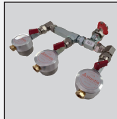
Parallel Tee 3 Gang AC.TFK.PT.3