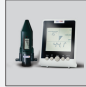
Sonic Smart GA.AP.SM