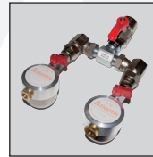
Parallel Tee AC.TFK.PT