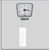
Clock Face GA.CG.4