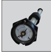
Spiral Float* GA.F2.4